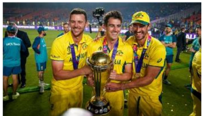
Aussie's captain Pat Cummins, Josh Hazlewood, and Mitchell Starc with the World Cup trophy.

Then, in the 2nd Innings, Aussies' lost their 3 wickets of Warner (7), Mitch Marsh (15) and Steven Smith (4) earlier in the powerplay. But Marnus Labuschagne (58 out of 110) and Travis Head (137 out of 120) made a partnership of 192 runs. Glenn Maxwell finished the match as a billion Indians were heart broken.